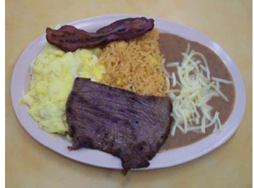
DESAYUNO LA CHIQUITA