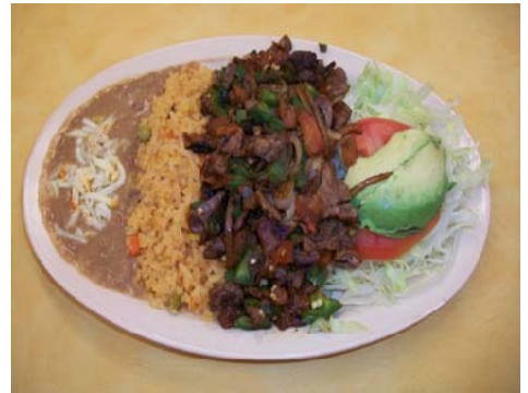
BISTEC A LA MEXICANA