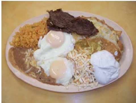
CHILAQUILES CON HUEVO